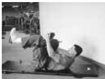
Pull the crossed leg towards you

Allow me to demonstrate how everyone can benefit quickly from two easy exercises. If you have a fitness question you would like answered, please e-mail me at oko.hartleroad@gmail.com and look for the answers in the next "Community Connection".