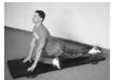
Pull the crossed leg towards you